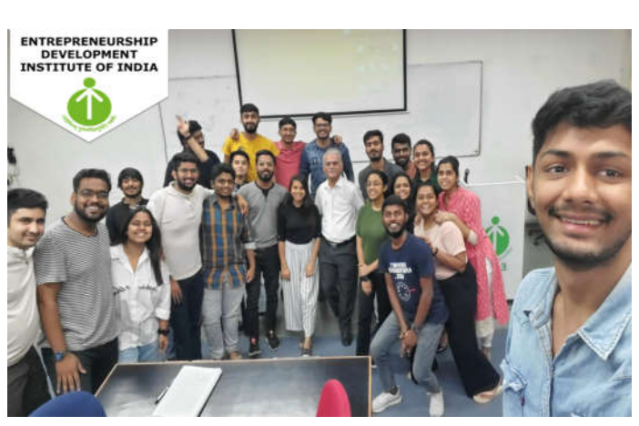
EXIM Course at EDII (Entrepreneurship Dev. Inst. India)