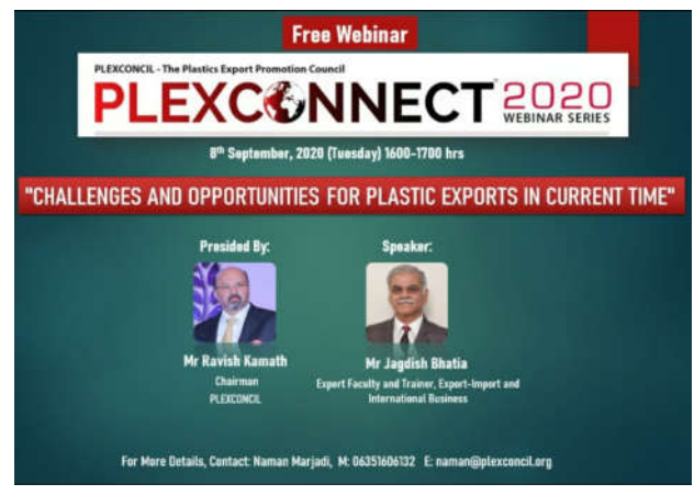
Session at Platic Exp. Promotion Council