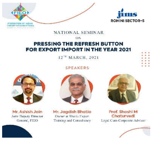
Session with FIEO