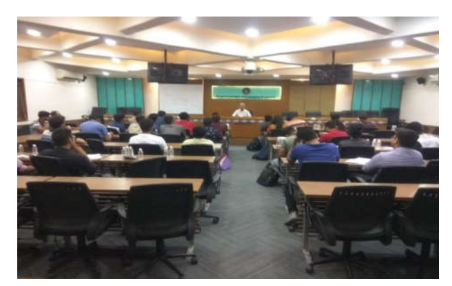
Training Session at Gujarat Chamber