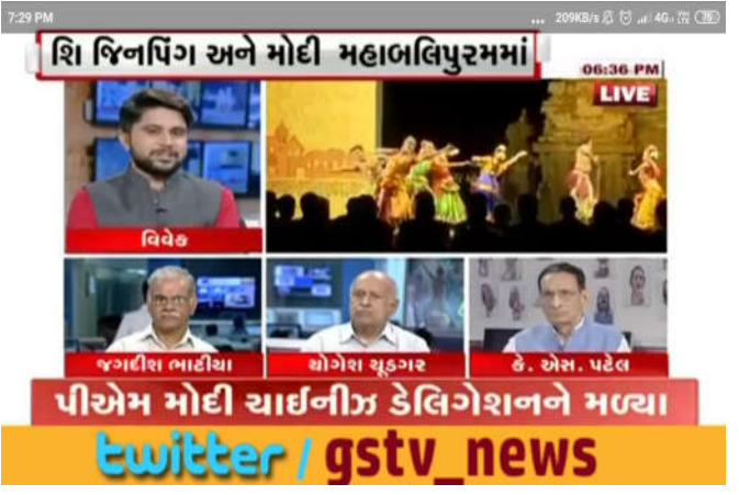
Interview at GSTV