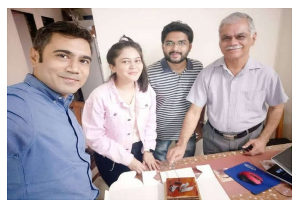
Personalized Training for a batch of 3 students