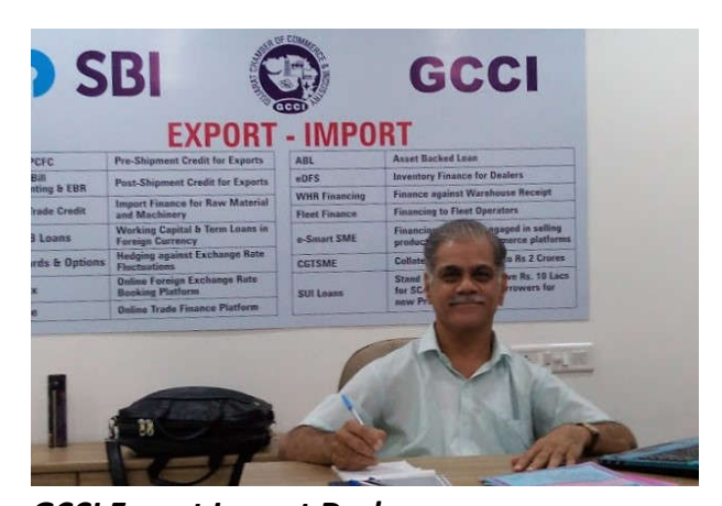
GCCI Export Import Desk