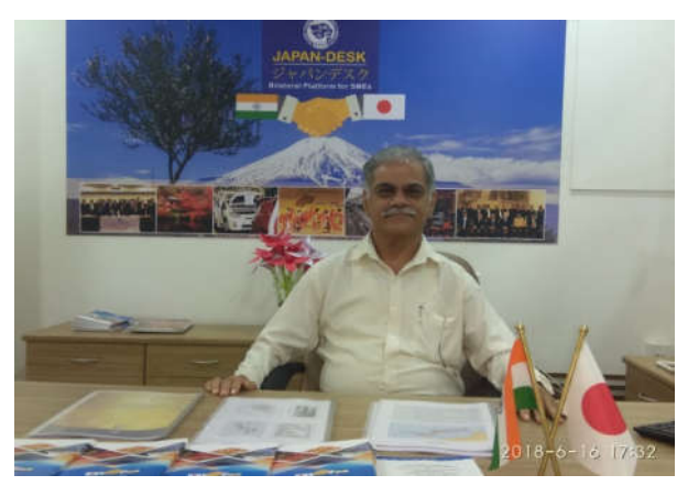
Japan Desk for SMEs